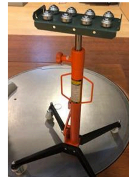
Fig2. Lift refit with roller