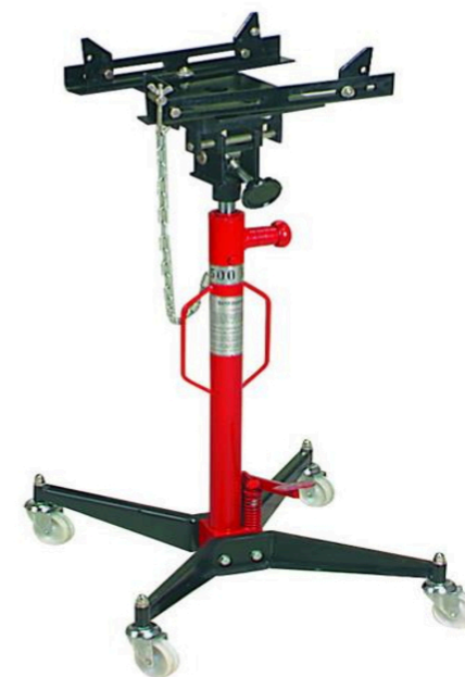
Fig.1. commercial lift

METHOD To allow maximum range of treatment gantry movement, a small footprint adjustable jack stand was designed, assembled, and tested for IGRT. • The commercial jack stand was modified (Fig.1) with an 8-ball transfer roller on the top platform (Fig.2). • Maximum gantry rotation range was tested • KV source and panel rotation range (Fig. 3) was tested • Lateral MV images were acquired • 2D KV-KV images were acquired • Orthogonal KV-KV image registration and couch shifts were tested