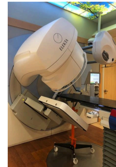
Fig3. Collision testing

CONCLUSIONS A new couch-top support platform has been designed, assembled, and tested for image-guided radiotherapy. Given the small footprint with the limited posterior occupation, image guided VMAT radiotherapy becomes feasible compared to old couch support devices like the genie lift. Moreover, the new support platform is easy to use, cost effective and would allow heavy patients to be safely treated with image guided radiotherapy.